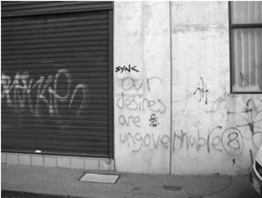
Figure 1 The title piece of our article, Fitzroy, Melbourne.

to the bodies of metal, concrete and plastic, which typically compose the surfaces of urban worlds. In short, where graffiti is often thought of as destructive, we would submit that it is affective as well.