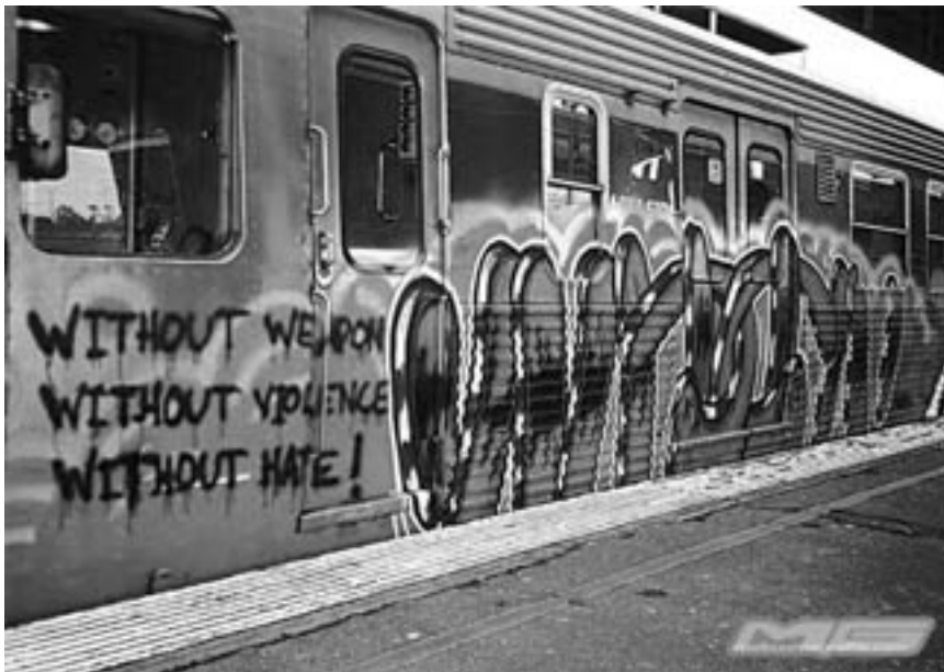
Figure 3 Train panel, by Bonez, 70K crew (1970s kids). Note the benevolent tone of the message 'Without weapon, Without violence, Without hate'.

We would equally take to task that brand of cultural criminology that inadvertently casts graffiti writers as disenfranchised or discursively effaced bodies who seek to challenge profoundly or, by way of contrast, seek to find a footing within, the 'oppressive' structures of late capitalism. Put differently, we have difficulty placing graffiti writers within a 'carnival [which purports to facilitate] a playful and pleasurable resistance to authority where those normally excluded from the discourse of power celebrate their anger at their exclusion' (Presdee, 2001: 26–7). Putting aside the issue of whether there is a single unified discourse of power and whether it is ever possible to occupy a point outside of such a discourse, we would take issue with the kind of subject constituted by such a view. So much of cultural criminology is concerned with the senselessness and excess of behaviour—of the subject who lets go, escapes the mundane, suspends rationality and who actively seeks out disordered and (temporarily) chaotic experiences. Indeed, the pre-eminent trope (or catch-cry) of cultural criminology would be something akin to 'transcendence through irrationality' (see Katz, 1988).