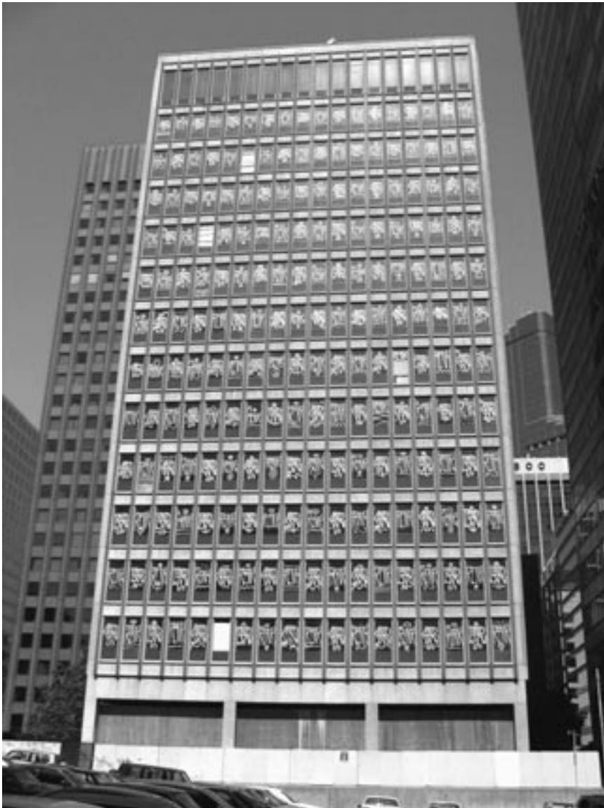
Figure 2 Office building, CBD, Melbourne. The windows on three sides of this building (those sides within public view) have been tagged in precise script. Each tag was written backwards (by two writers who were necessarily inside the building while putting up) so that work would be legible when viewed from the street.

Interviewee: Something that's not being used, . . . like a big blank wall, I think of that as like a negative space . . . Like not being used and you think, 'Yep, well, I could style that up and do a big blockbuster kind of style.'